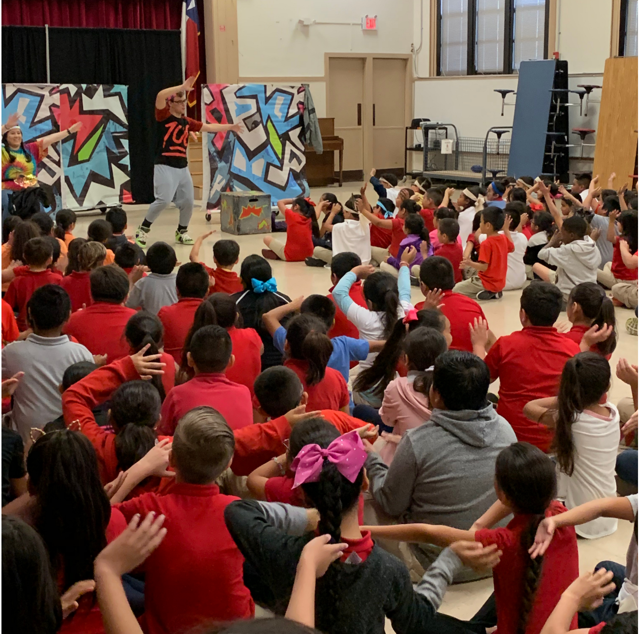
Express Children's Theatre performs Ali Baba and the 40 Thieves at Mading Elementary.