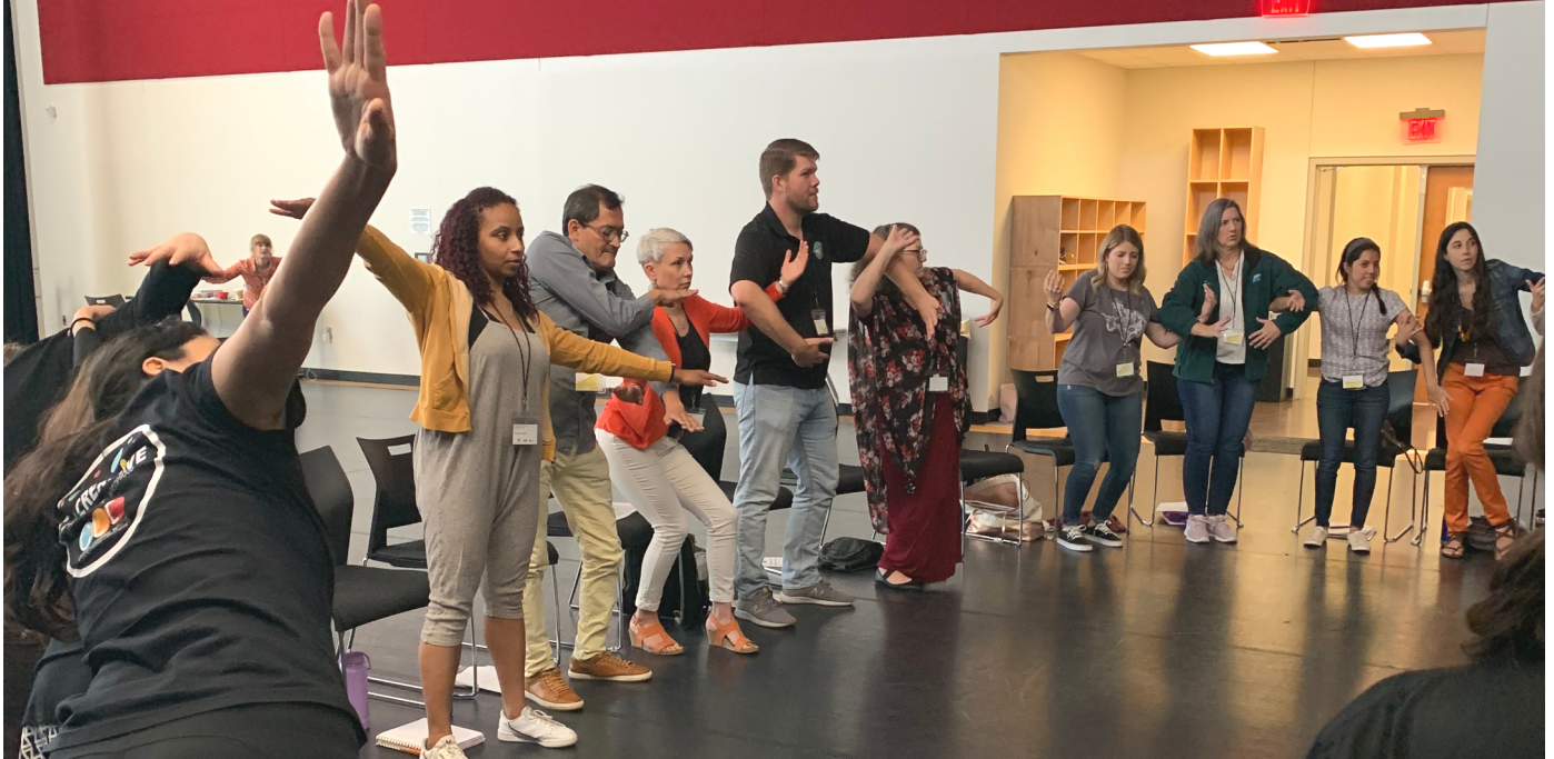
Educators explore science through dance at the Kennedy Center SW Arts Integration Conference.