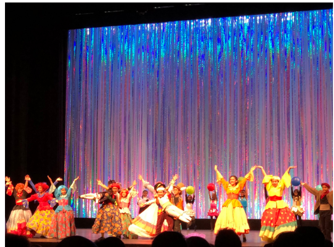
HISD Fine Arts Extravaganza at Miller Outdoor Theatre.

Despite these benefits, as of today, not all public school students in Houston have equal access to an arts-rich education.