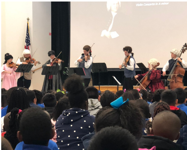
Mercury Chamber Orchestra performs "What's on Ben Franklin's iPod?" at Valley West Elementary.

Studies show that active participation in arts education can boost the development in artistic and social-emotional competencies including self-management, self-discipline, interpersonal skills, and self-expression, all critical tools for success in education and beyond. 2