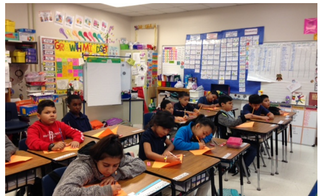
Writers in the Schools doing Arts Immersion work at JR Harris Elementary.